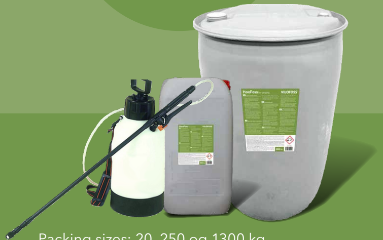
Packing sizes: 20, 250 og 1300 kg.

The treatment with HooFoss should always be started with at least one month of spraying to ensure a controlled and optimal effect.